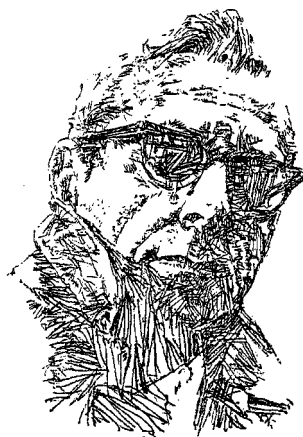
Loren Corey Eiseley September 3, 1907 - July 9, 1977

"We have joined the caravan, you might say, at a certain point; we will travel as far as we can see, but we cannot in one lifetime see all that we would like to see or learn all that we hunger to know."